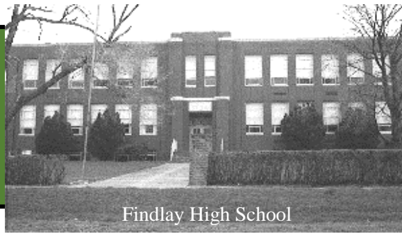
Findlay High School