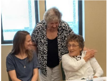
Current & former Cowden-Herrick teachers visit