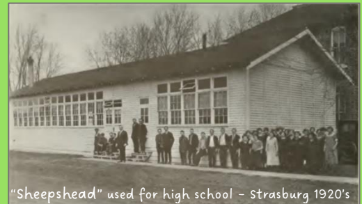
"Sheepshead" used for high school – Strasburg 1920's

It looks like Spring is trying hard to get going this year. I noticed that the daffodils were blooming everywhere nearly three weeks ago. Since then we have had some freezing temperatures and a hail storm. However the grass has turned bright green and many have been out rolling down mole hills and doing their first mowings. Mother Nature is always in control.